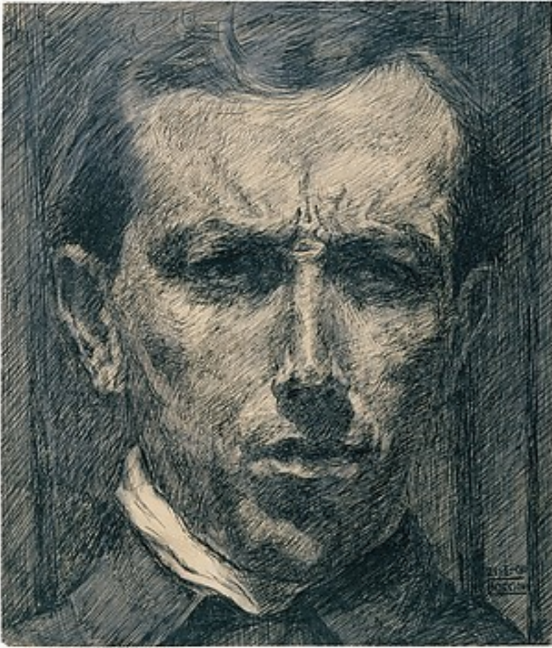
28. Self Portrait by Umberto Boccioni